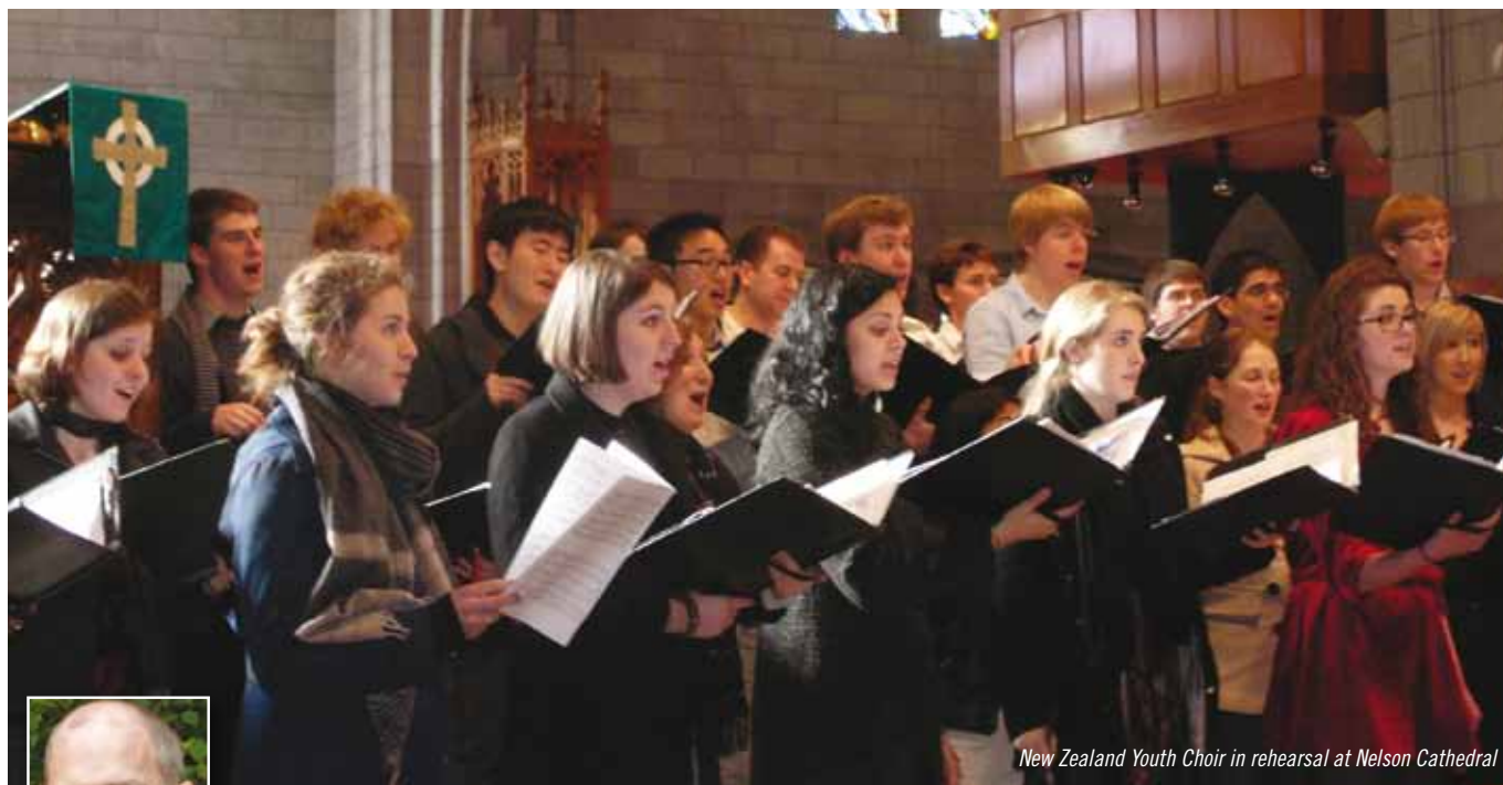
New Zealand Youth Choir in rehearsal at Nelson Cathedral