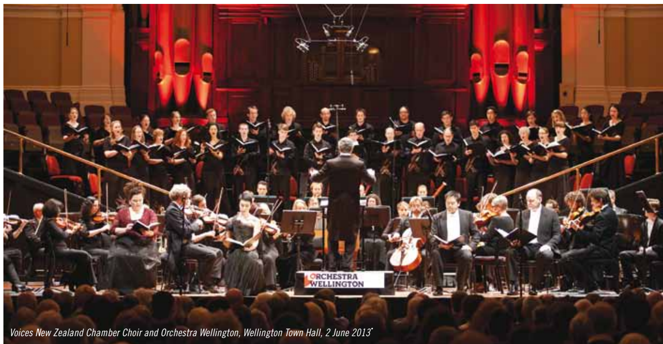
Voices New Zealand Chamber Choir and Orchestra Wellington, Wellington Town Hall, 2 June 2013