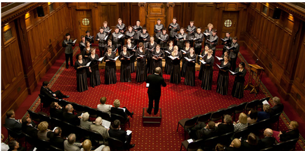
NZ Youth Choir in Parliament 19 November 2012.