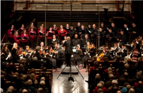
Mozart Requiem by Candlelight.