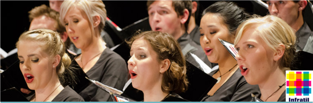
New Zealand Youth Choir, Hastings 2012.