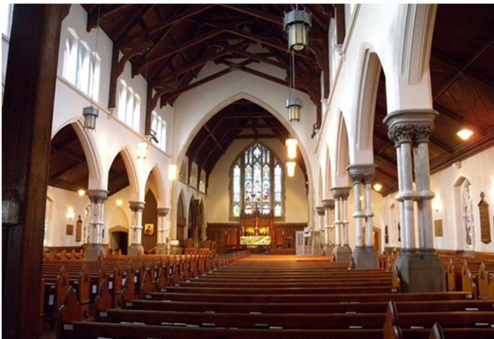
Christ Church Cathedral, Ottawa.