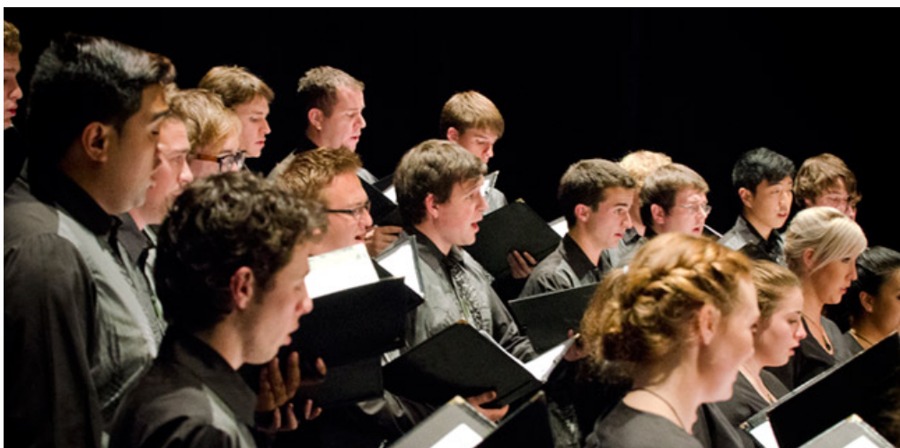
New Zealand Youth Choir in concert, Hawke's Bay Opera House April 2012