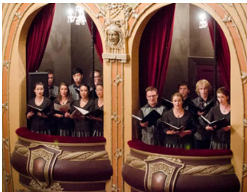
Members of NZYC in HB Opera House, April 2012.