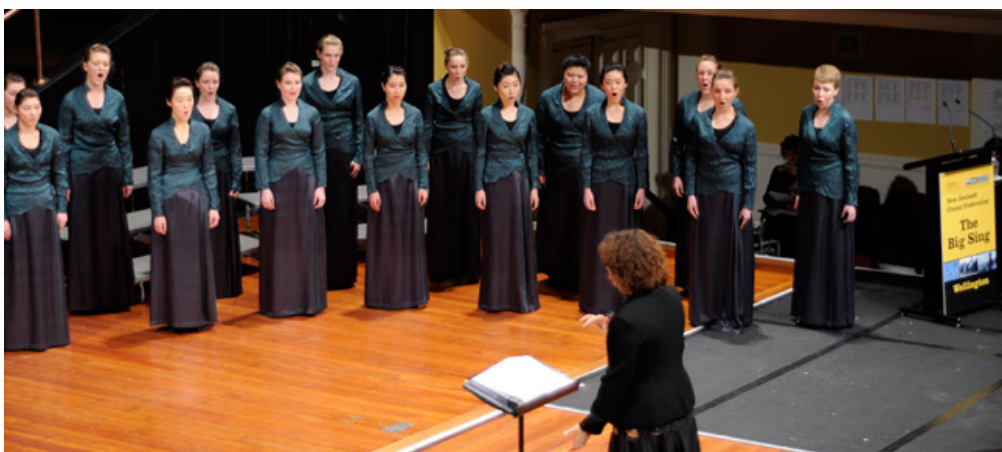
Bel Canto - Platinum Award Winners 2012.

The audience included large troupes of schools parties cheering on their favourites, justly proud parents and grandparents, choral aficionados and last, but certainly not least, the Hon Christopher Finlayson, Minister of Arts, Culture and Heritage who greatly enjoyed the concert and gave out prizes at the end. The carnival atmosphere, complete with Mexican waves and (perhaps) spontaneous choruses from the schools attending were in stark contrast to the professional presentation of the performances. This was choral singing of a very high standard.