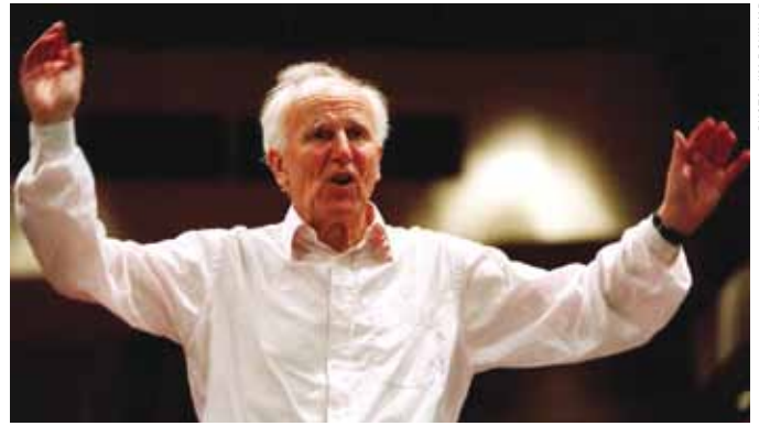
Sir David Willcocks conducts a rehearsal in 2001.