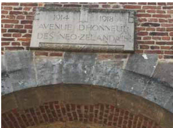
A Street in Le Quesnoy.

A further group of famous venues awaits the Youth Choir and all have strong choral traditions. There will be lunchtime concerts at St George's Chapel in the grounds of Windsor Castle, in the Lady Chapel of Ely Cathedral, and an evening concert in Oxford. The tour ends with a performance in the Cambridge Summer Music Festival. All the performances will be special in their own way. We can't wait! Information about the NZYC 2016 European Landmark Tour will be available on www.choirsnz.co.nz soon.