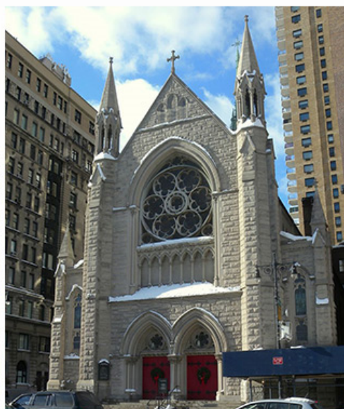
(Top) Interior of Trinity Wall Street Church, New York City. (Bottom Left) St Paul's Chapel, New York City. (Bottom Right) Holy Trinity Lutheran Church, New York City.